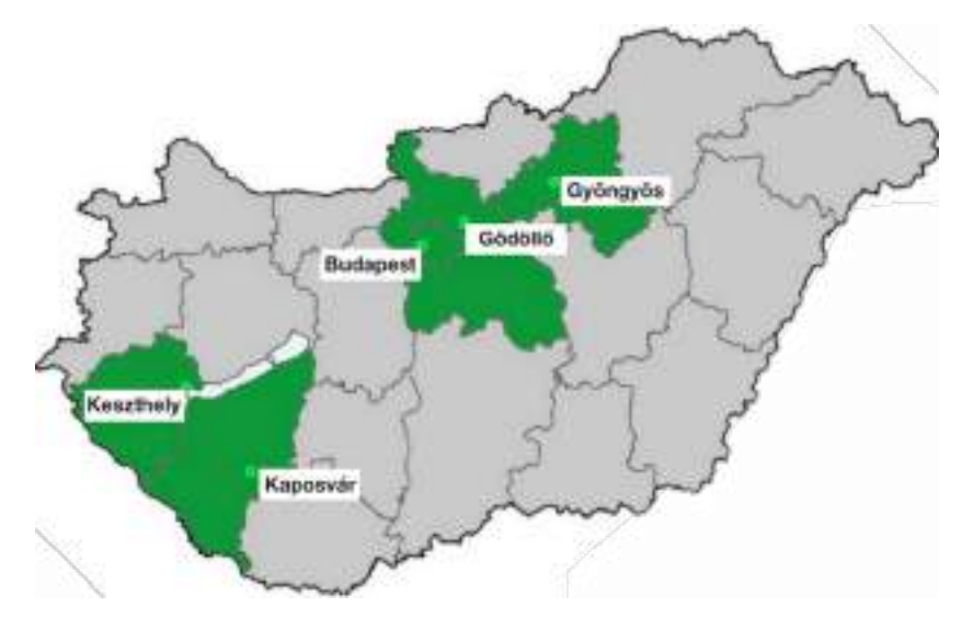
Figure 1. The campuses of the Hungarian University of Agriculture and Life Sciences

On the 1st of February 2021, the Hungarian University of Agricultural and Life Sciences was established. At the same time, the eleven research institutes and companies of the National Agricultural Research and Innovation Centre and the Agricultural Research Institutes of the University of Debrecen and the Research Institute of Karcag (Figure 1). MATE is thus not only an educational institution but also a scientific, practical and innovation centre for the sector.