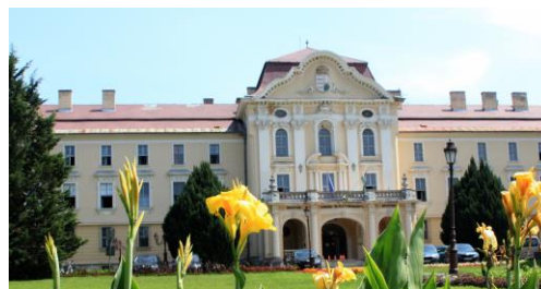
Szent István Campus