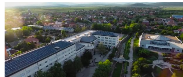
Károly Róbert Campus Gyöngyös