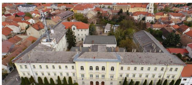
Georgikon Campus Keszthely