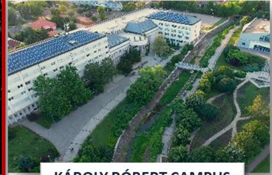
KÁROLY RÓBERT CAMPUS