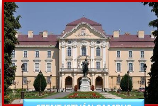
SZENT ISTVÁN CAMPUS