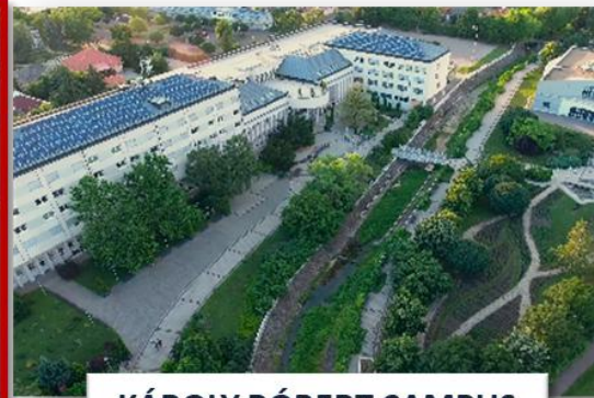
KÁROLY RÓBERT CAMPUS