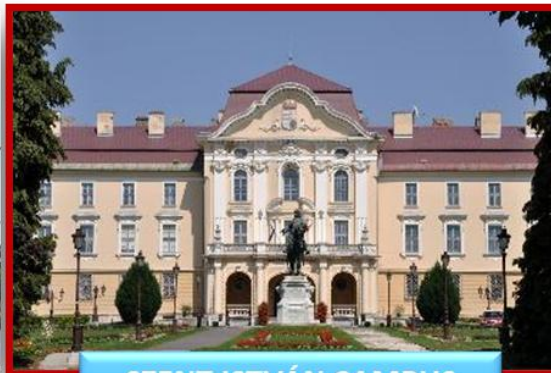
SZENT ISTVÁN CAMPUS