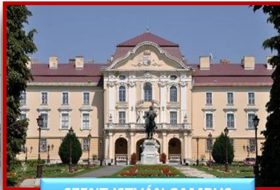
SZENT ISTVÁN CAMPUS