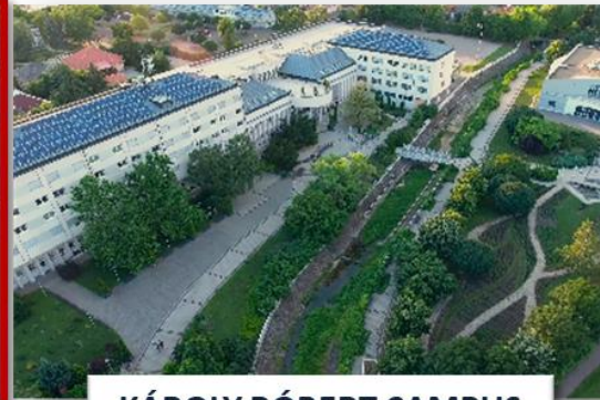
KÁROLY RÓBERT CAMPUS